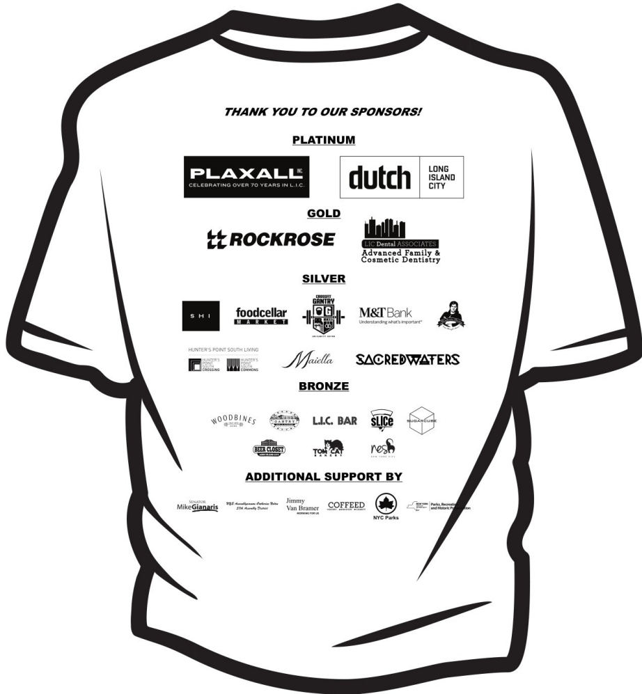
(Last year's sponsors on back of t-shirts given to all 1,200+ participants)